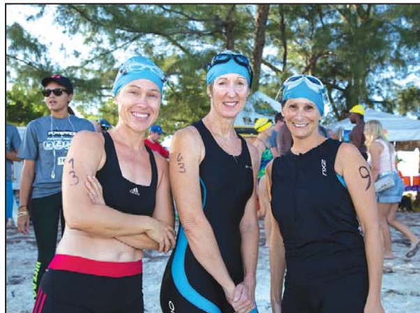
●LET'S GO: Ladies waiting to start the Powerade Potcakeman Triathlon