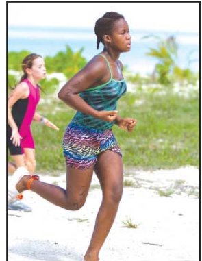
●RUNNING: Kids on the run course