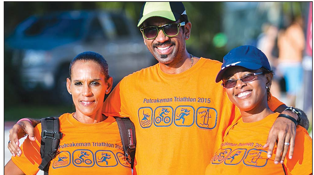
●HARD-WORKERS: Some of the volunteers who helped to make the Powerade Potcakeman Triathlon a super success