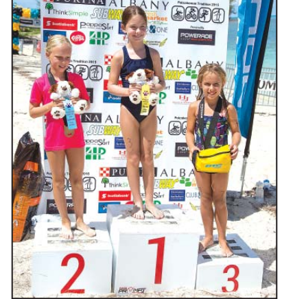
●WELL DONE: 8-&-Under girls are awarded