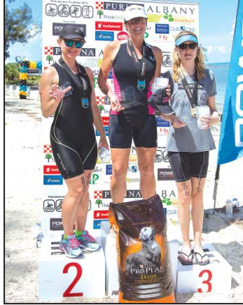
●POWER-WOMEN: Ladies' top 3 finishers