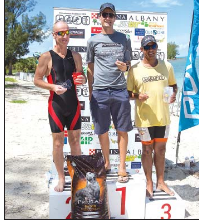
●WINNERS: Men's winners accept their awards