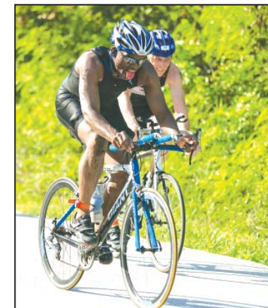
●BUSY BIKERS: Cyclists on the bike course