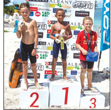
●TOP BOYS: Boys 8-&-Under top triathlon finishers