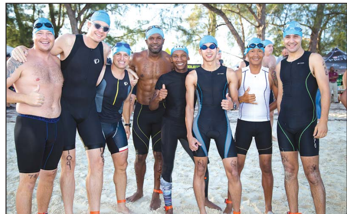
●GUY-GANG: Some of the Powerade Potcakeman Triathlon competitors pose for a photo